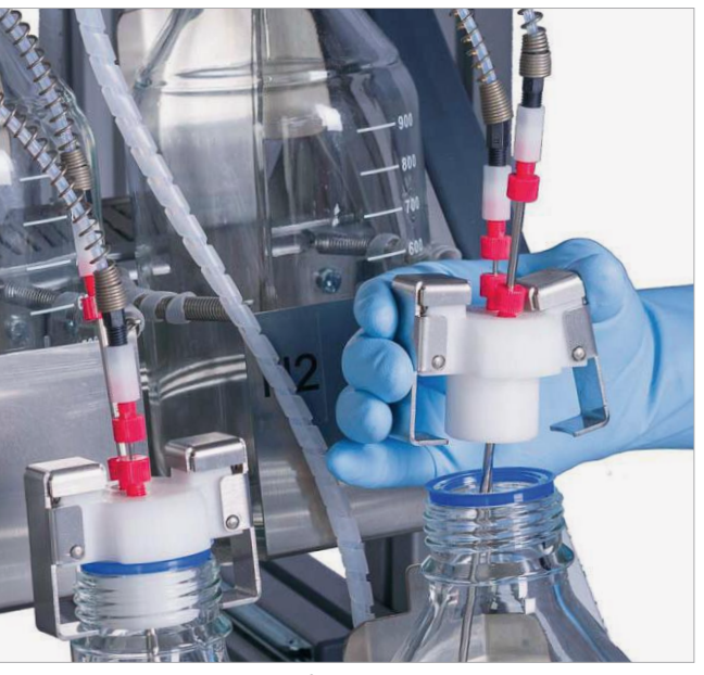
Sample bottle with closure for single handed operation