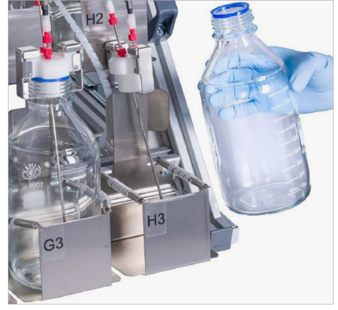
Easy filling of the sample rack with sample bottles