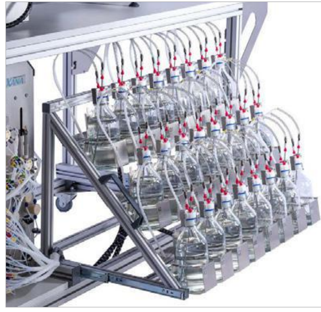
Extendible sample rack for 24 x 1 L sample bottles