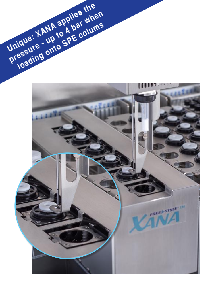
Processing station on the FREESTYLE platform