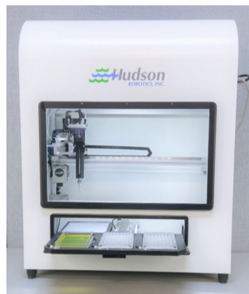
The RapidPick SP

Harvester: Provides aspiration of colonies, for use with semi-solid media.